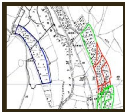
Map 2. Co. Wicklow (3 rd Edition OS, 1910)