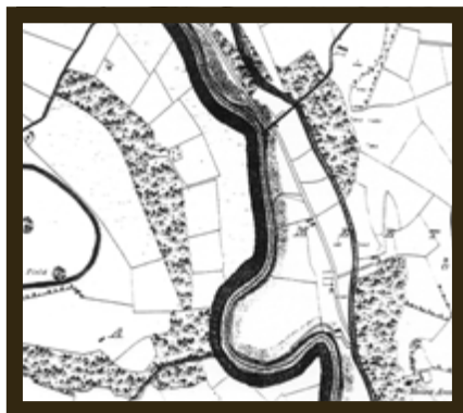
Map 1. Co. Wicklow (1 st Edition OS, 1839)